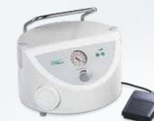
MEDAP BORA UP 2080 OP