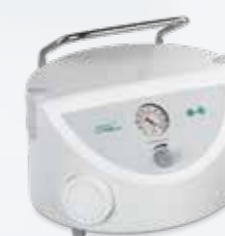
MEDAP BORA UP 2080