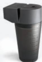
Single-patient secretion canister