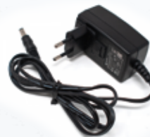
Mains power unit