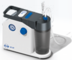
ATMOS LC 27