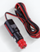
Car connecting cable