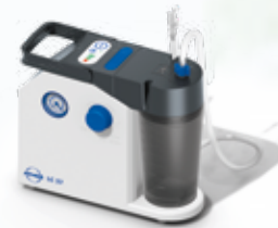
ATMOS LC 27 Battery