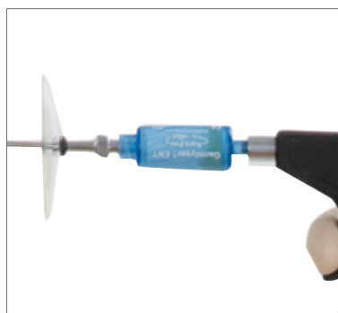
6 Hygiene filter for water flushing