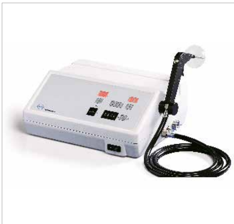
1 ATMOS Variotherm plus