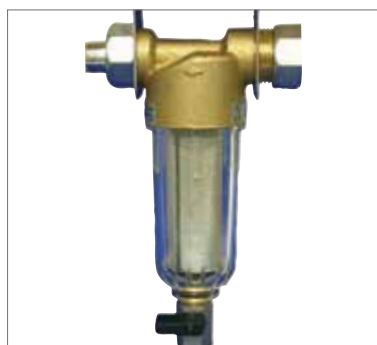
2 Water prefilter for ENT units