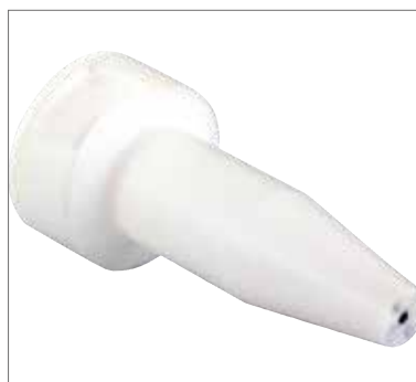
3 Rinsing connection for thermic stimulation