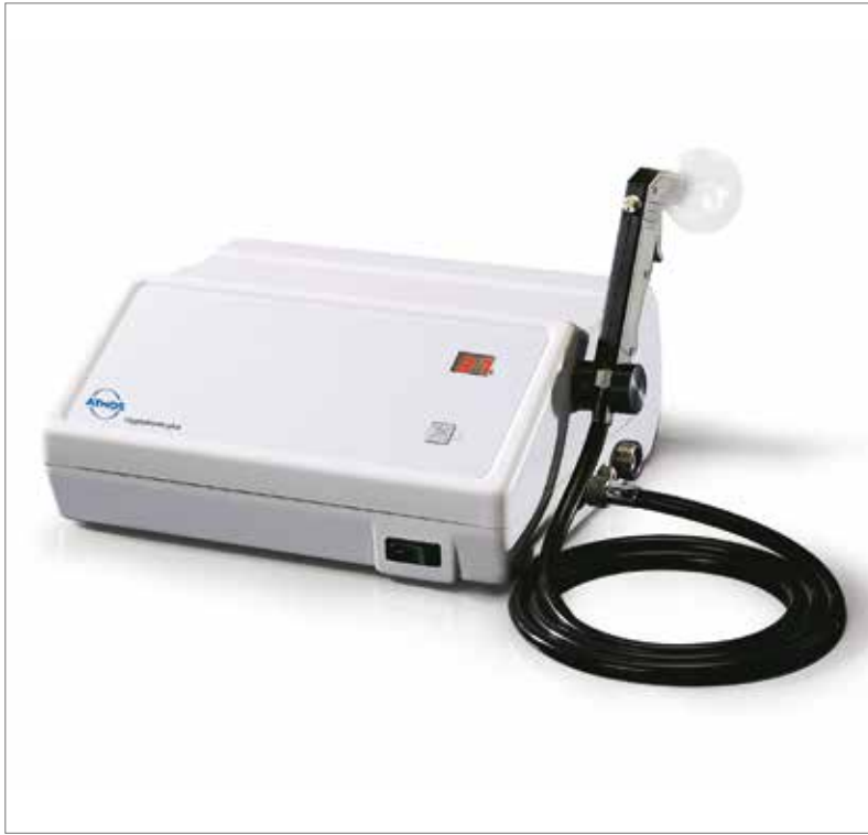
1 ATMOS Hydrotherm plus