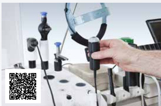
Scan the QR code for detailed information

Our LED light modules are cooled passively by a sophisticated ventilation system, are completely noiseless, and don't stir up any dust. Thanks to the optimized light connection system, the endoscope and tissue never heat up, even when the module is running at maximum power.