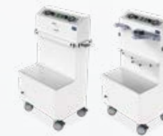
ATMOS TWIN RECORD 55