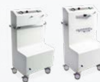
ATMOS RECORD 55